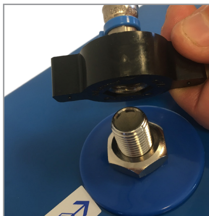
Attaching the water outlet hose (blue)