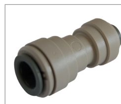
3/8" — 1/4" Straight JG Push-Fit Connector QUANTITY— 2