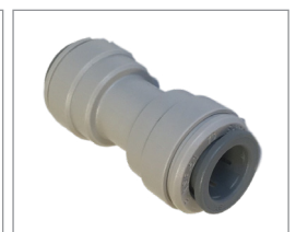
3/8" — 3/8" Straight JG Push-Fit Connector QUANTITY— 2